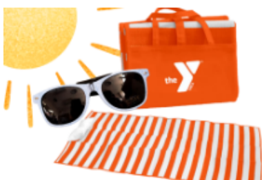
& 1 FAMILY DAY PASS TO THE BERNARD F WILLI OUTDOOR POOL!